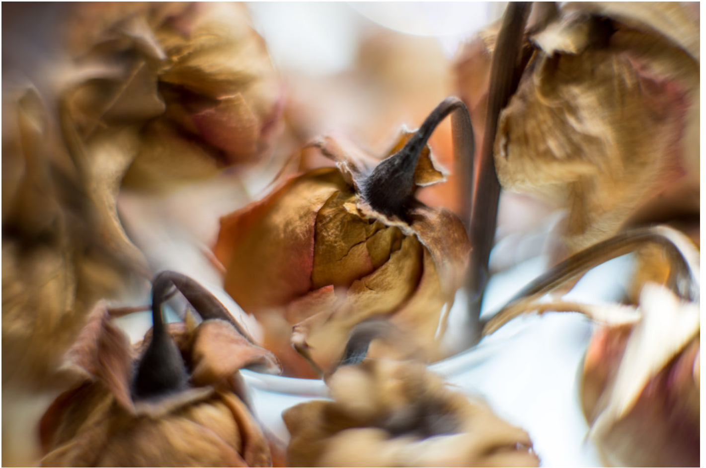
April 2015 Boonville California – Leica 90mm macro lens (2015) on Leica Macro Adapter (2014) on Sony A7ii camera (2015)