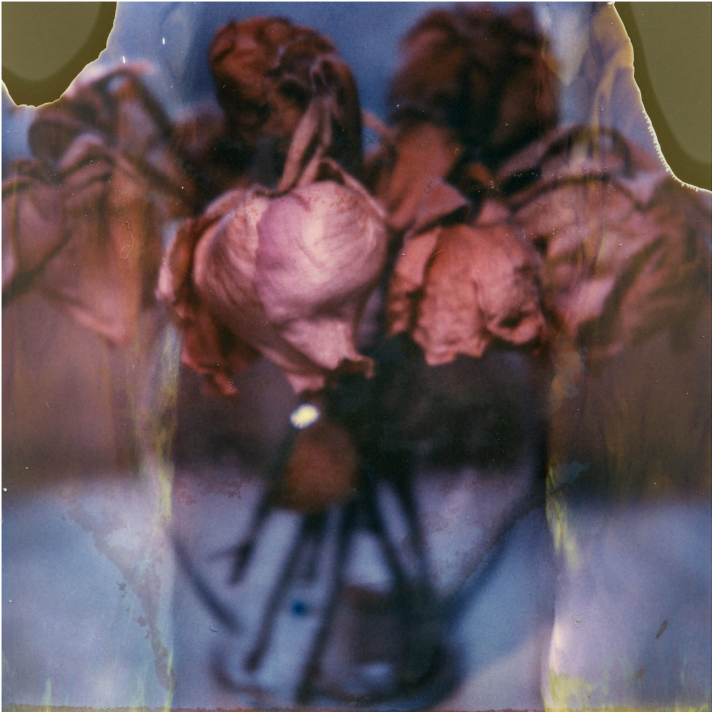
April 2015 Stanford California – Polaroid Time-Zero film stock (2006), SX-70 camera (1976)