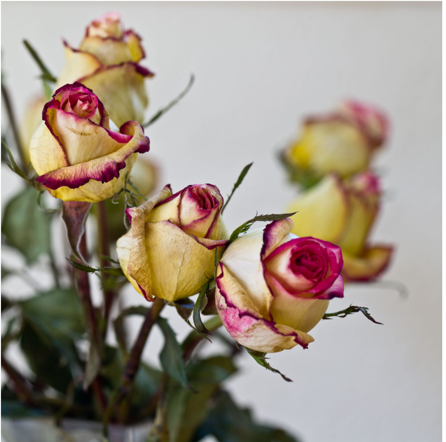
April 2006 Boonville California – Hasselblad 503CW camera (2000), Zeiss 120mm lens (2000), Hasselblad CFV digital back (2006)