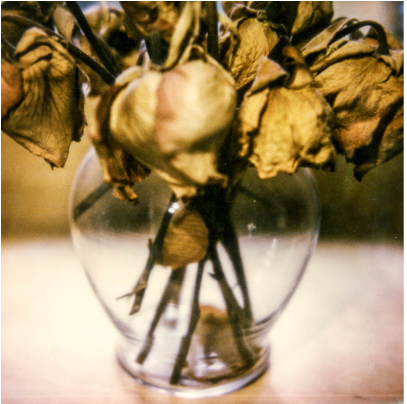
April 2015 Stanford California – Impossible Film stock (2012), Polaroid SLR 690 camera (2000)