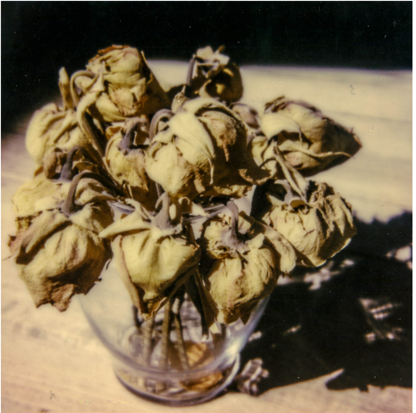
April 2015 Stanford California – Impossible Film stock (2012), Polaroid SLR 690 camera (2000)