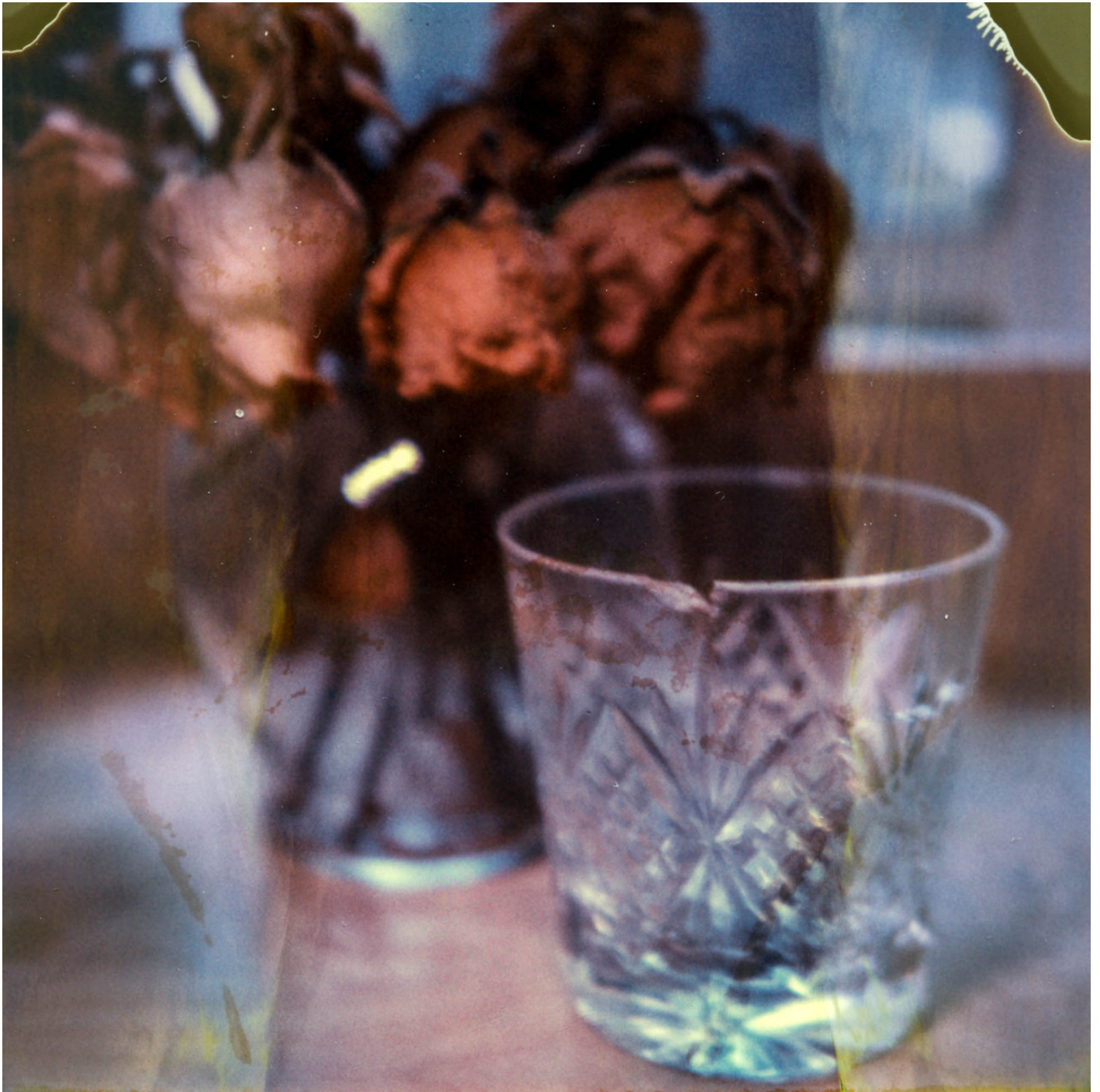
April 2015 Stanford California – Polaroid Time-Zero film stock (2006), SX-70 camera (1976)