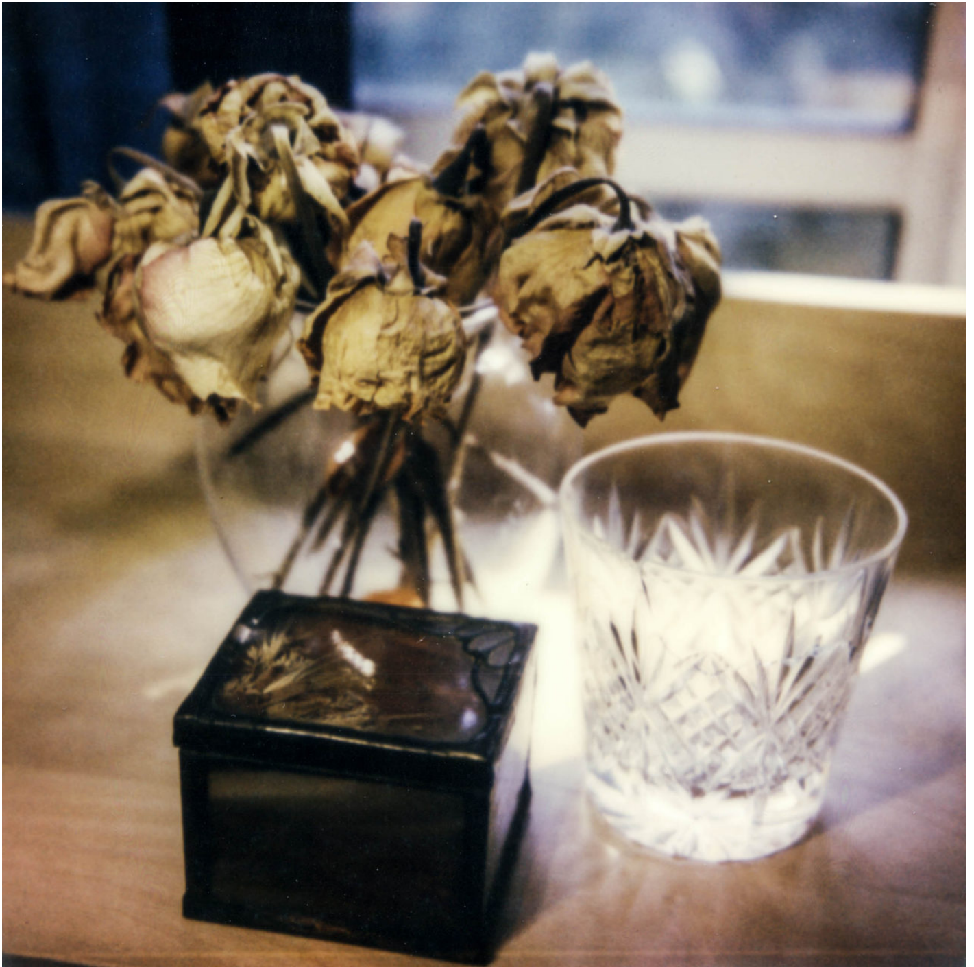
April 2015 Stanford California – Impossible Film stock (2012), Polaroid SLR 690 camera (2000)