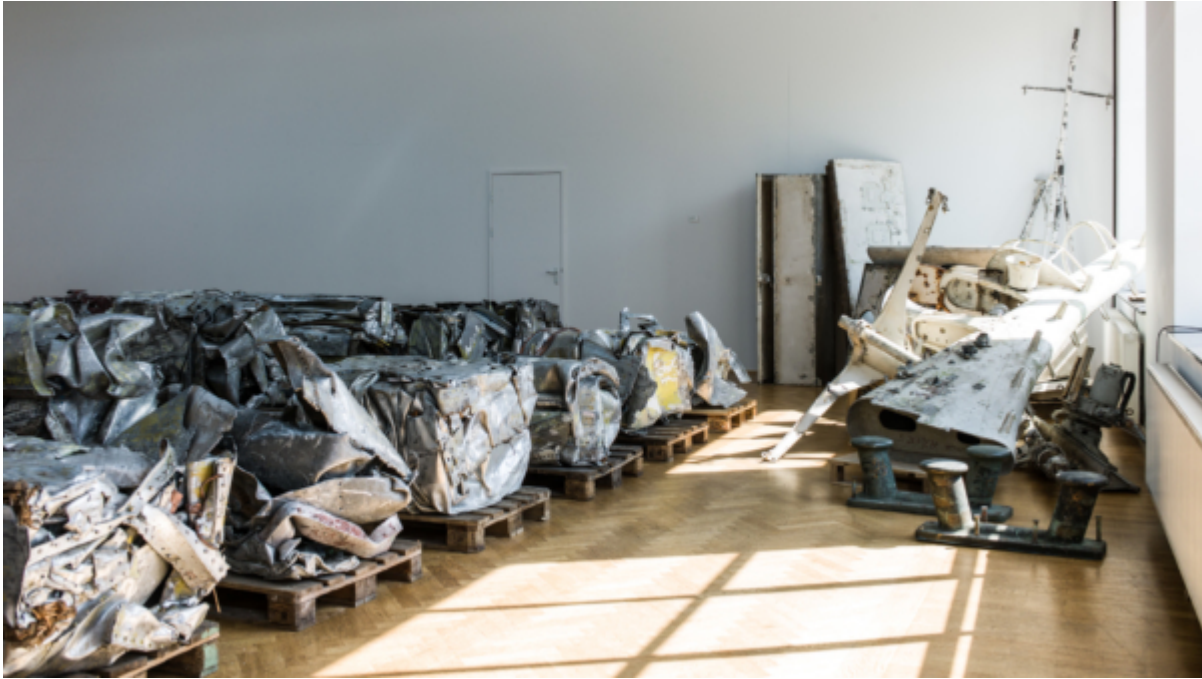
Fernando Sánchez Castillo – Franco's yacht