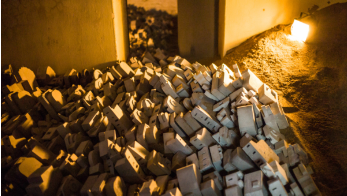
RAAF – models in a basement of WWII bunkers