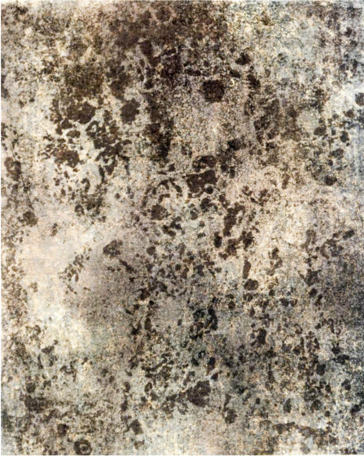
Scene on the earth – 1958 – lithograph