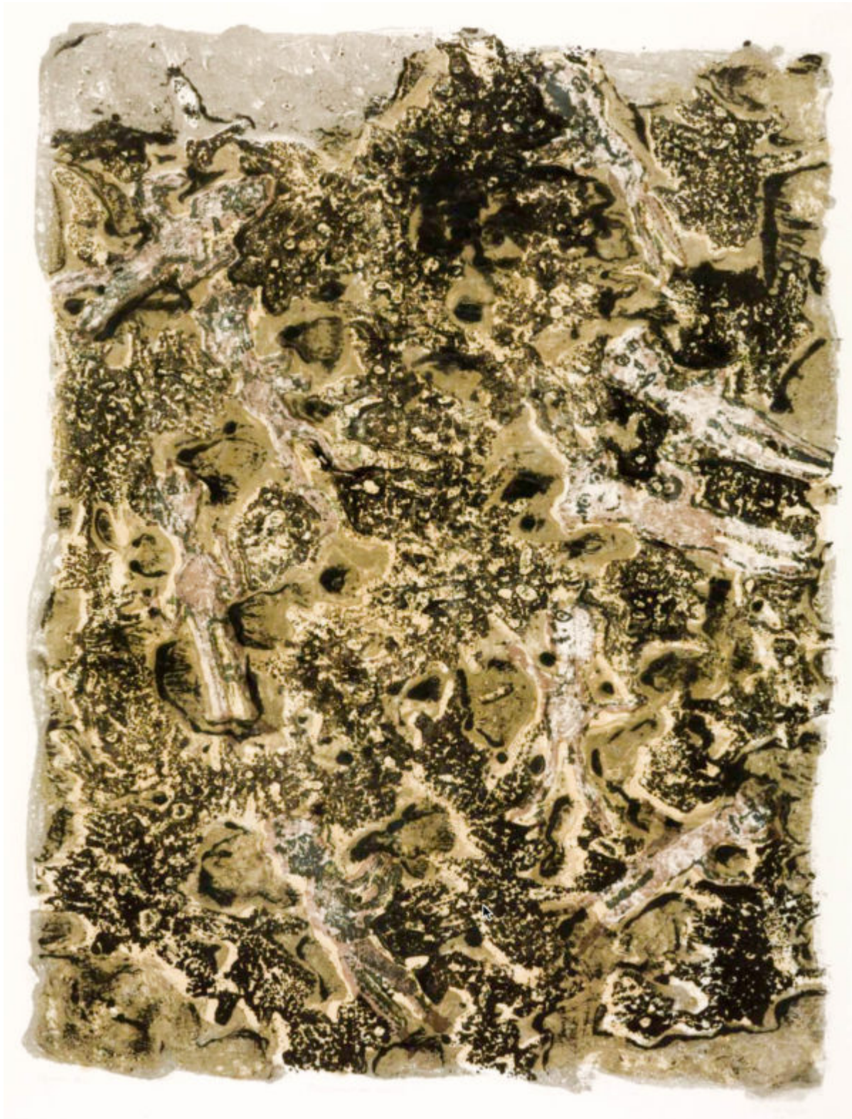
Peopling of the lands – 1953 – lithograph