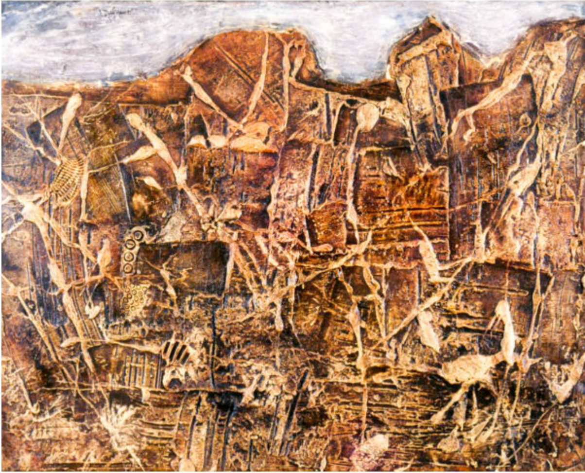
La vie des sous-sols – 1951 – oil on canvas