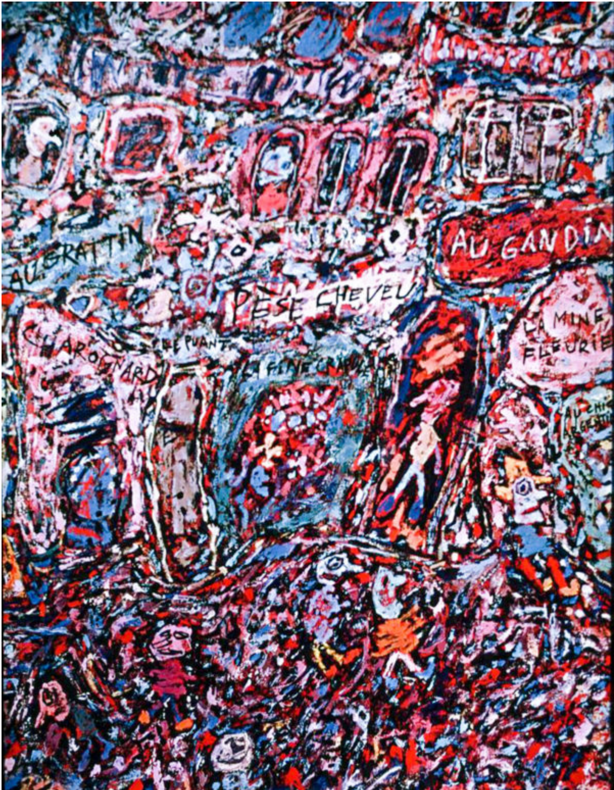
Tail Hair – 1962 – oil on canvas