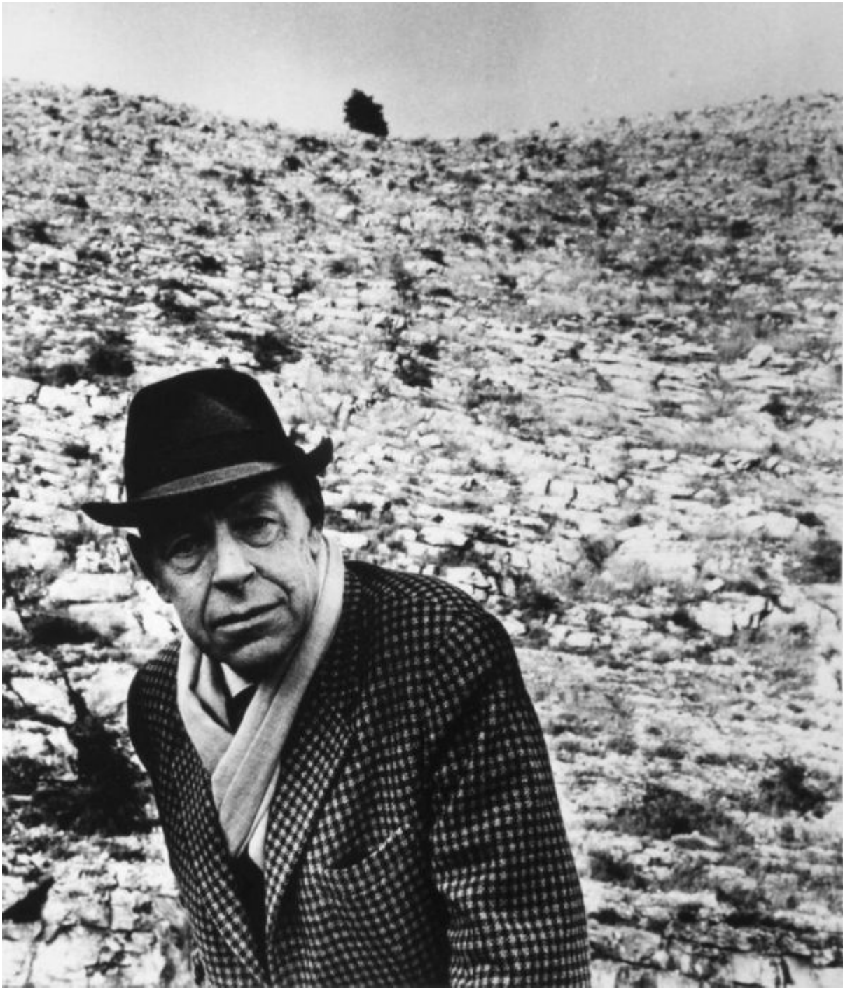
Dubuffet by Bill Brandt