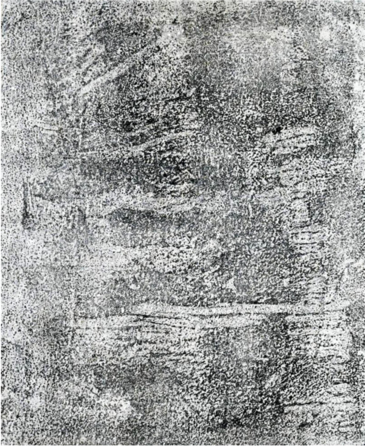
Carelessness – 1961 – lithograph