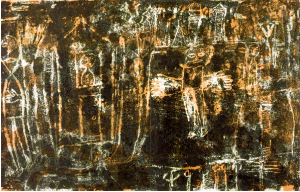
Inhabited landscape – 1946 – lithograph