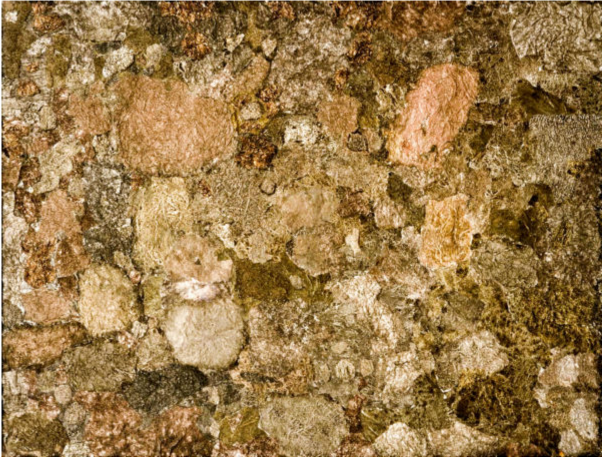
Soul of the underground – 1959 – oil on aluminum foil on composition board