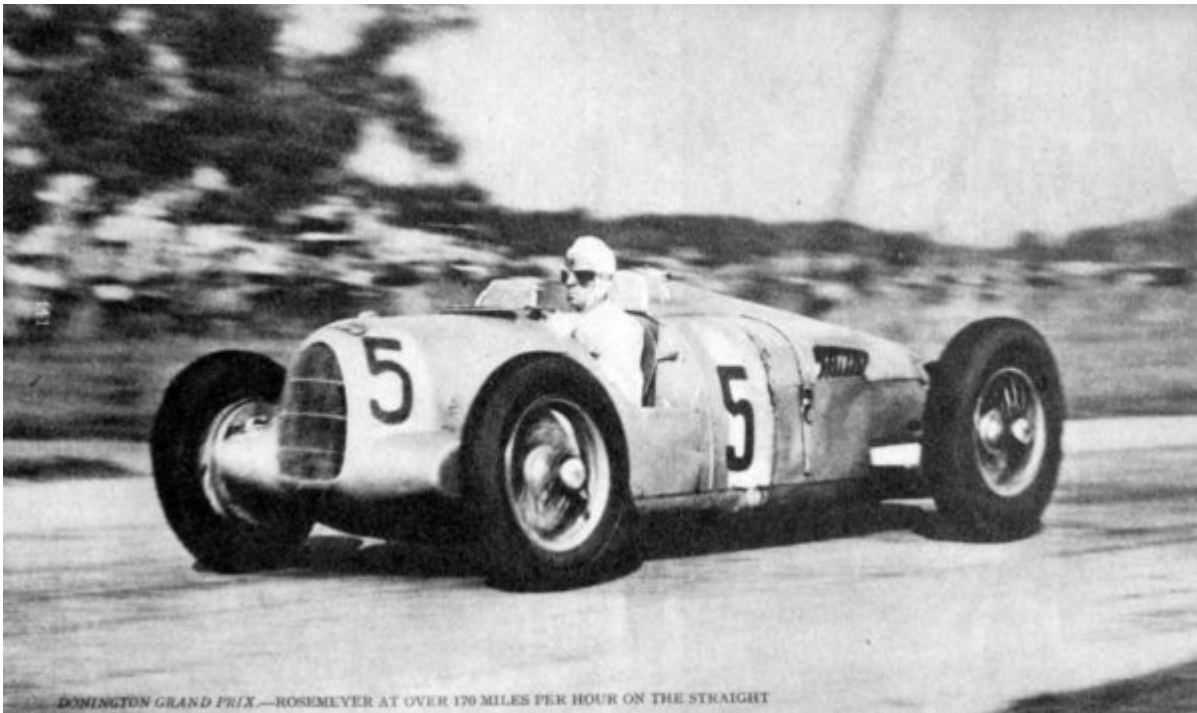
Bernd Rosemeyer at Donington in 1936