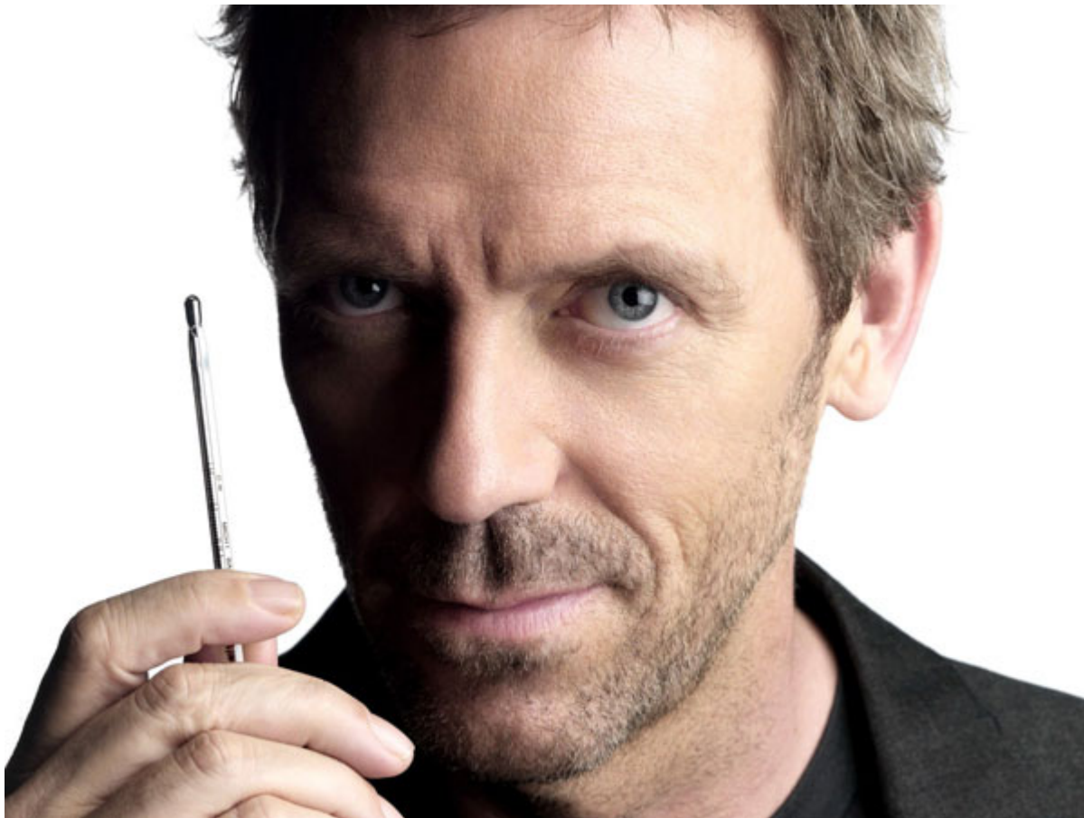
The diagnostician – a contemporary archetype – Gregory House MD [Link]

Previous post on design thinking – [Link]