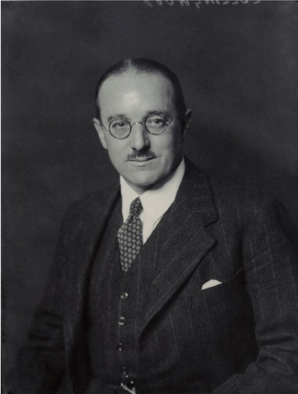
Collingwood – National Portrait Gallery, London