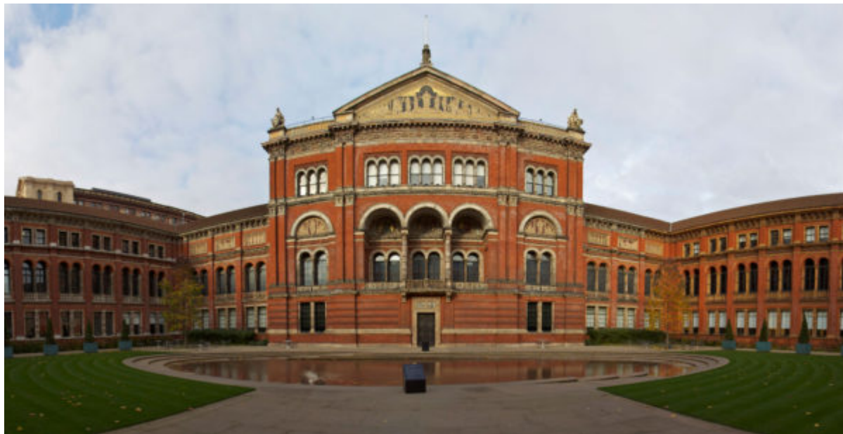
The Victoria and Albert, South Kensington, London – original facade – established to improve British manufacturing