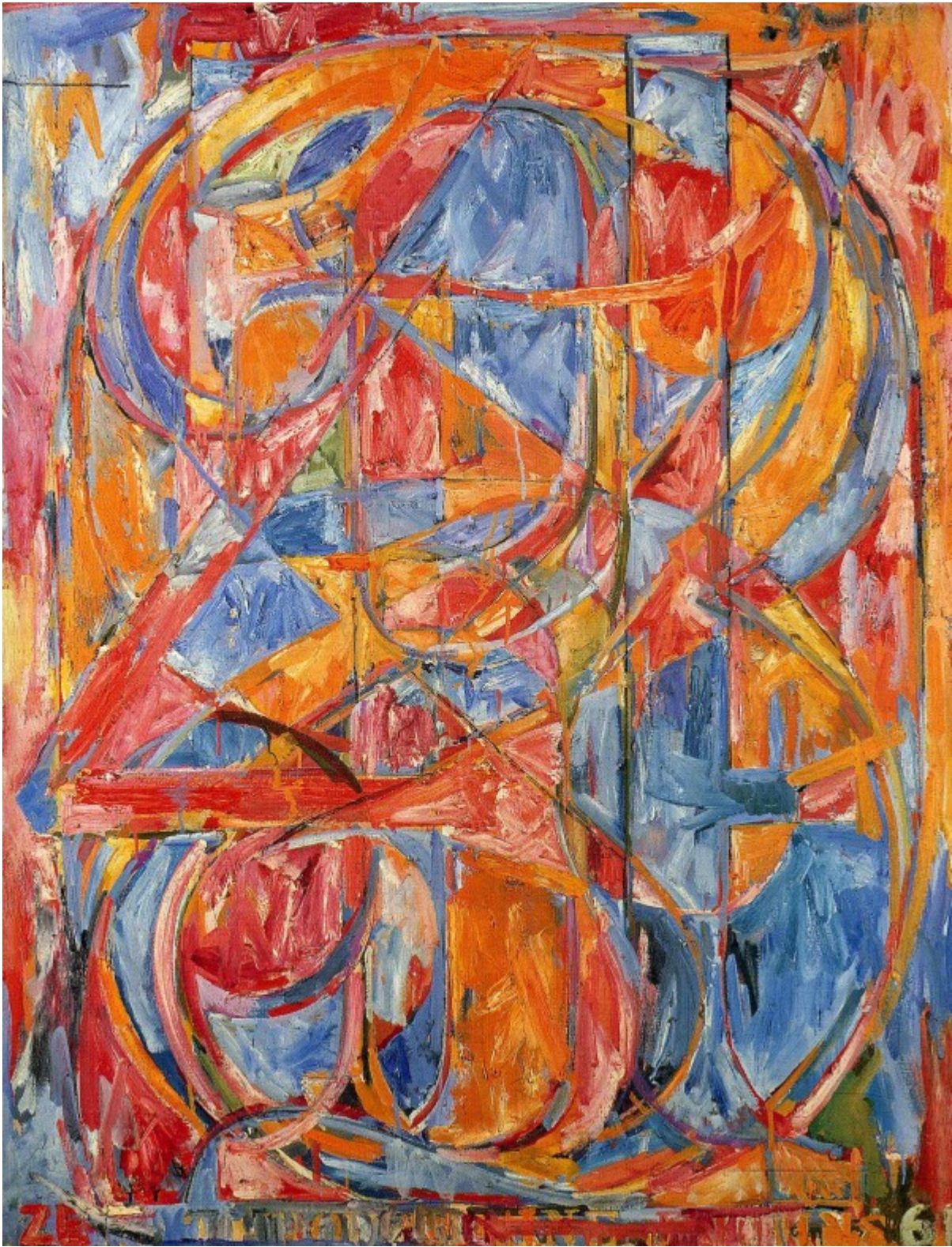
Jasper Johns, 0 through 9