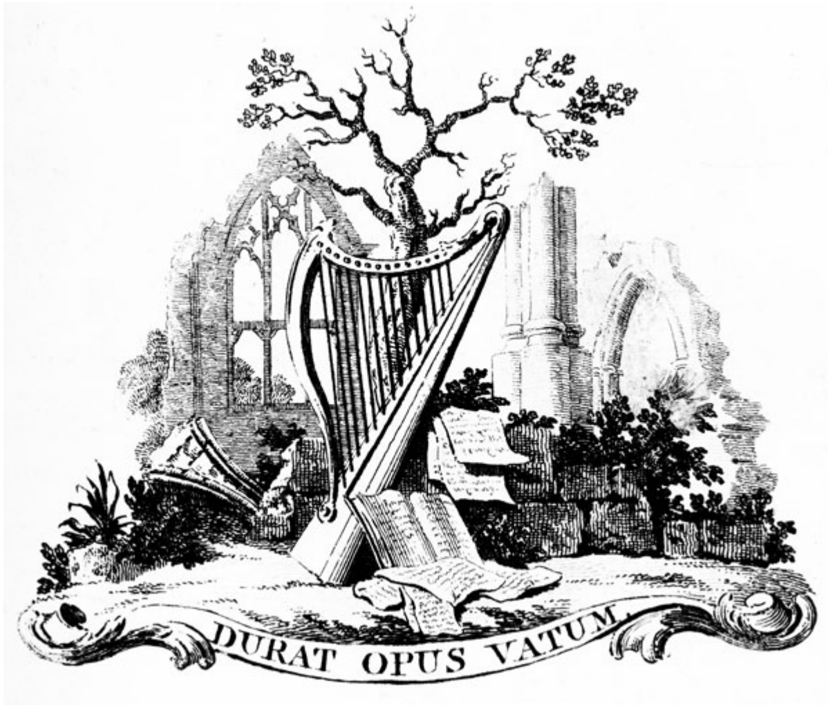
Thomas Percy, Reliques of Ancient English Poetry , 1765. Pages are blown in the wind; buildings fall in ruin, but the song of the poet endures.