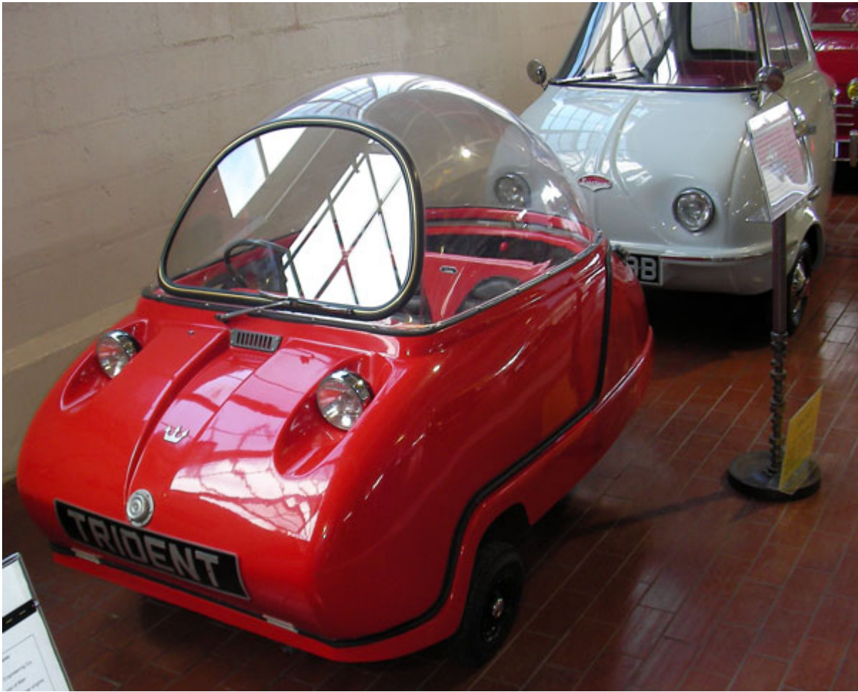
the extraordinary Peel Trident