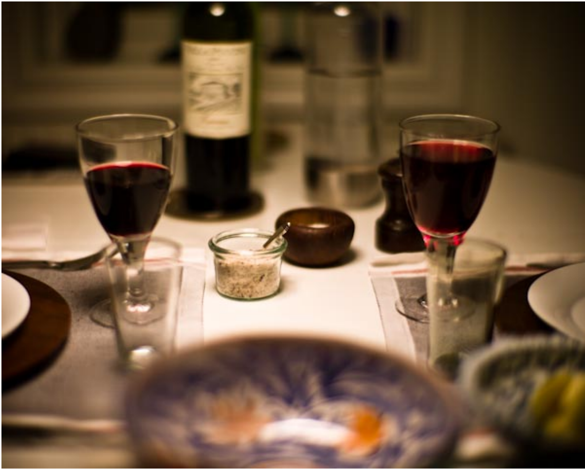
The salt of Hallstatt at Hindås