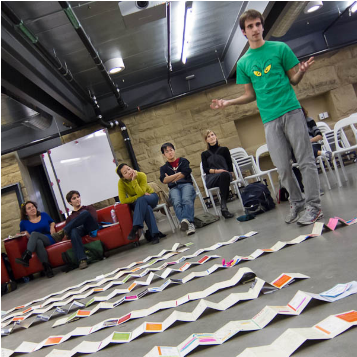
in class today – project notebooks as presentation/manifestation