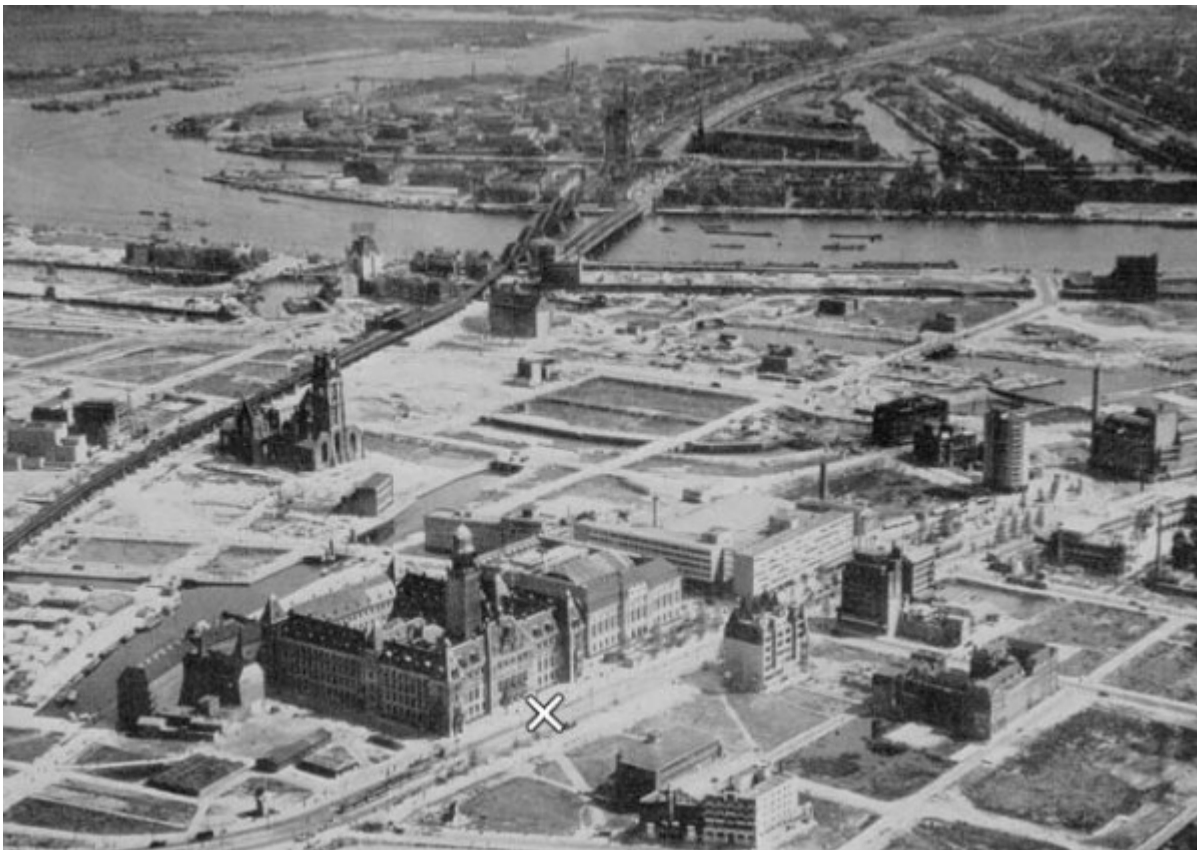
The bombing of the city by German invading forces, on the afternoon of May 14 1940. Around 2.6 square kilometres (1.0 sq mi) of the city was almost leveled. 24,978 homes, 24 churches, 2,320 stores, 775 warehouses and 62 schools were destroyed.