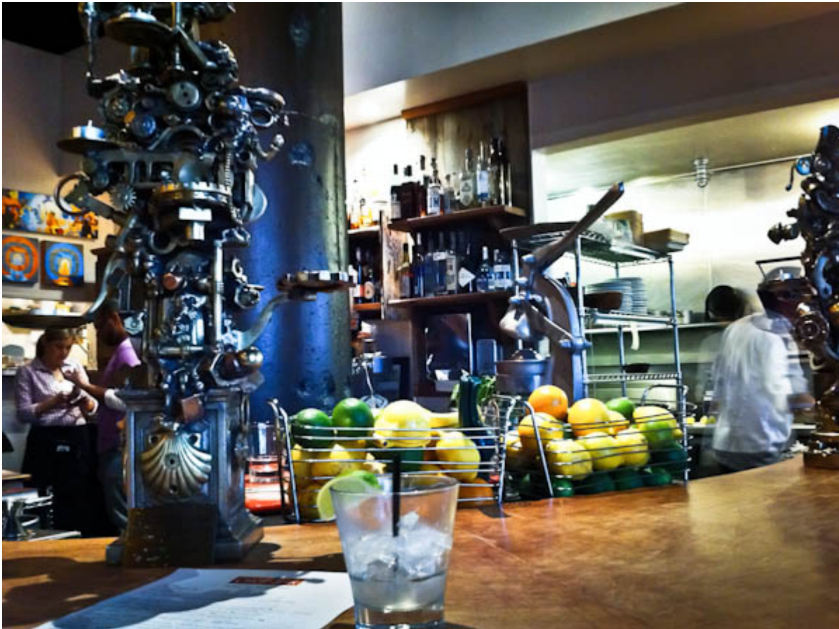
Steam punk bar furniture in The Chop Bar [Link]

Last week the BBC reported a new fund raising campaign to rebuild Babbage's Analytical Engine – his steam powered programmable computer the size of a house – [BBC Link] – Wikipedia on Babbage – [Link]