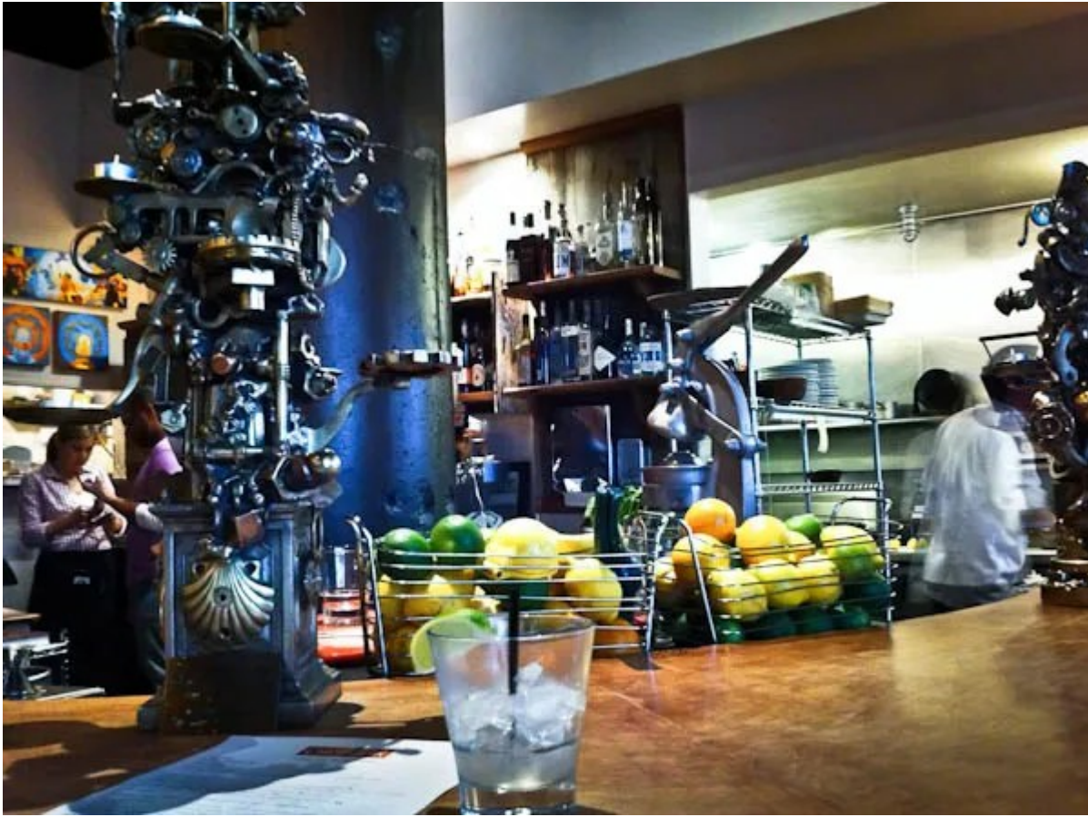
Jack London Square, Oakland. Waterfront/docklands development.