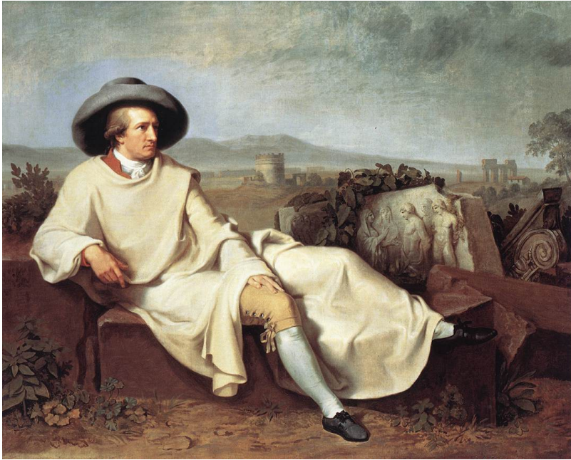
Goethe among the ruins of humanity's childhood

I was tempted to synthesize, from this mélange, some elements of a theory of ruin.